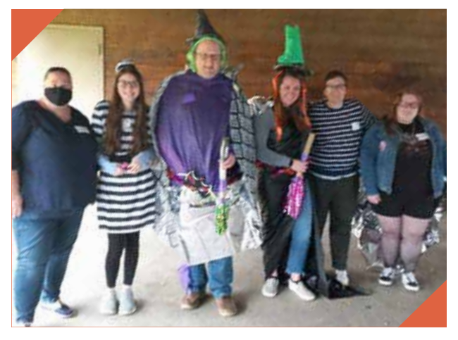
The make-a-costume candy corn group is all smiles at the OCMI matching event that brought together prospective foster/adoptive parents and youth Oct. 9 at Lone Lane Park in Upper Macungie Township, Pa.

"Already, we have a prospective match between a family and youth from this event, and several more under consideration."