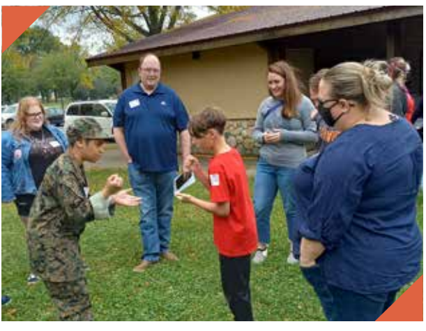
Prospective foster/adoptive parents and youth have fun with rockpaper-scissors at the OCMI matching event Oct. 9 at Lone Lane Park in Upper Macungie Township, Pa.